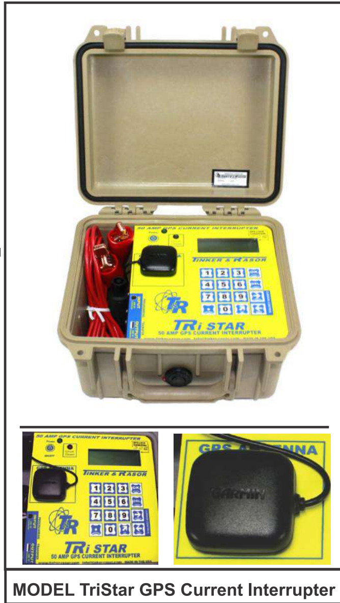
MODEL TriStar GPS Current Interrupter

11" x 7.5" x 10.5", 16 lbs (279.40mm x 190.50mm x 266.70mm, 7 kg)