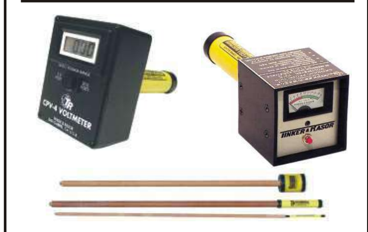
Half Cells, CP Voltmeters and Extension Handles