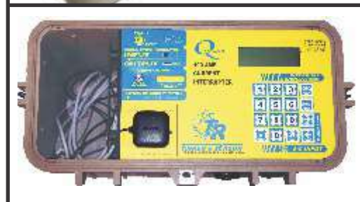
Cable Storage inside Case