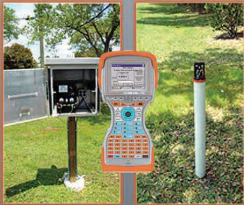
TEST SITE SURVEYS