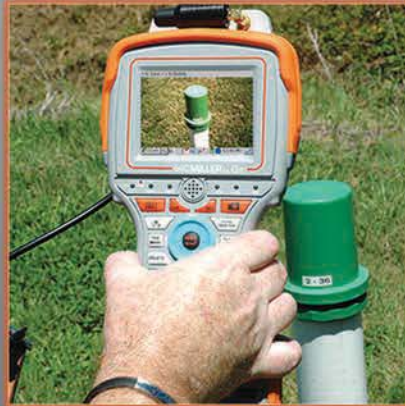
INTEGRATED DIGITAL CAMERA