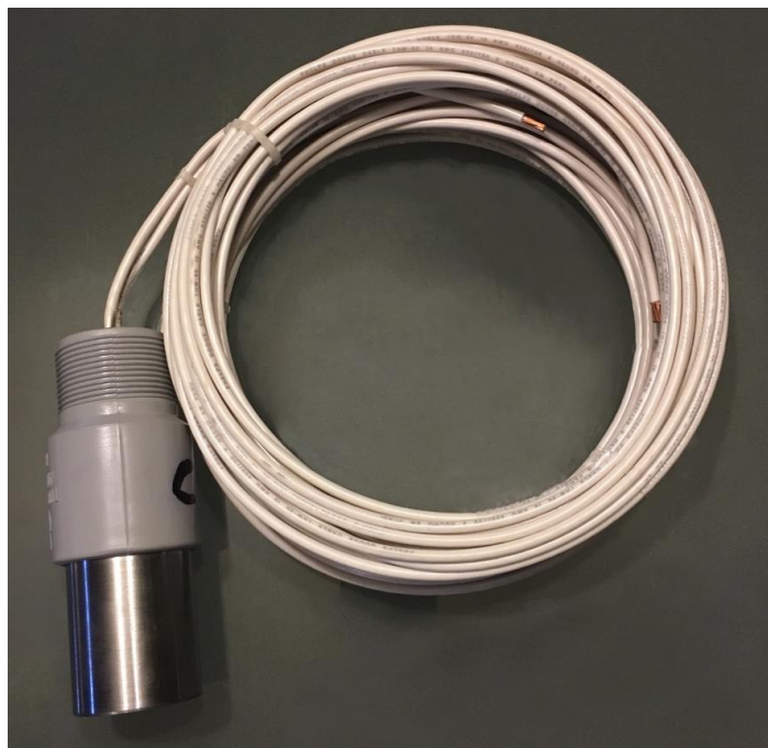
Exterior corrosion coupon for monitoring cathodic protection of platforms (100 cm 2 ) with 10 AWG THHN-THWN wire.